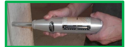
Rebound Hammer Test