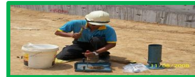
Field Density Test