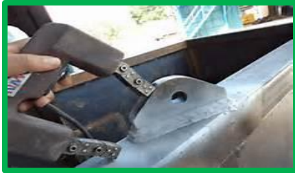
Magnetic Particle Test