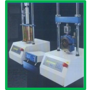
Automatic Control Data-logging Unit